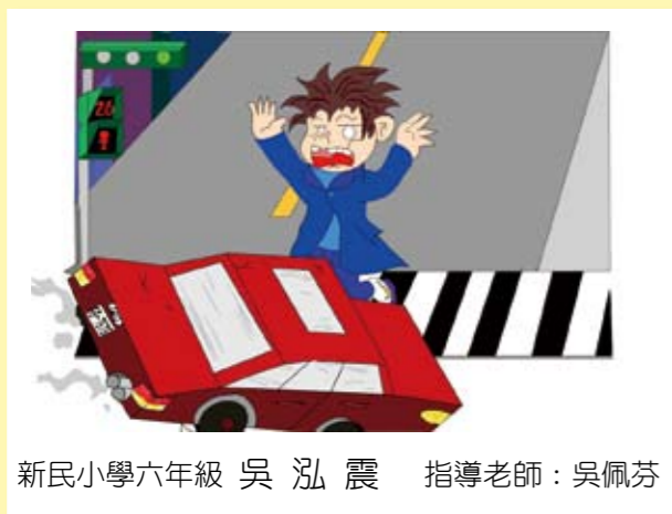
新民小學六年級 吳泓震 指導老師：吳佩芬