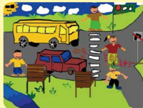
新民小學二年級 袁國軒 指導老師：李珮珮