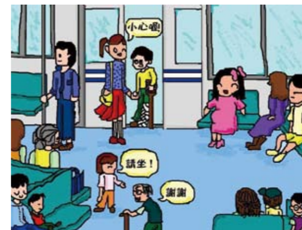
新民小學四年級 趙子云 指導老師：吳佩芬