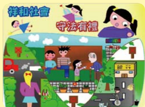
育才國小四年級 吳藩琦 指導老師：柯琬玲