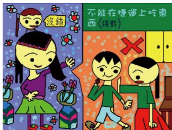
育才國小二年級 黃翊瑄 指導老師：全容萱