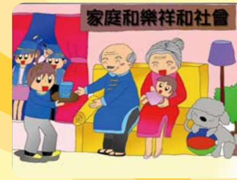
西松國小六年級 廖紋瑄 指導老師：侯政宏