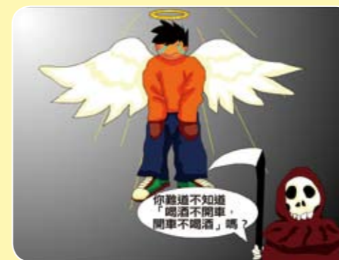
新民小學六年級 陳傑生 指導老師：李珮珮