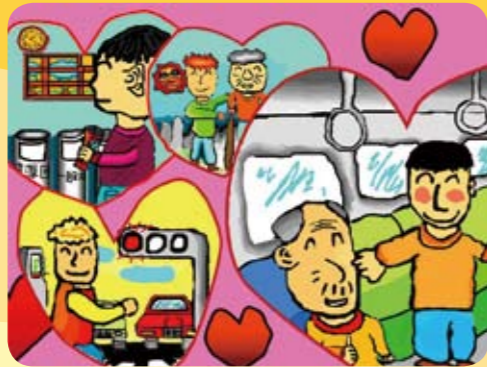
育才國小五年級 楊希哲 指導老師：彭依萍