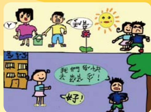
新民小學二年級 洪榕璟 指導老師：李珮珮