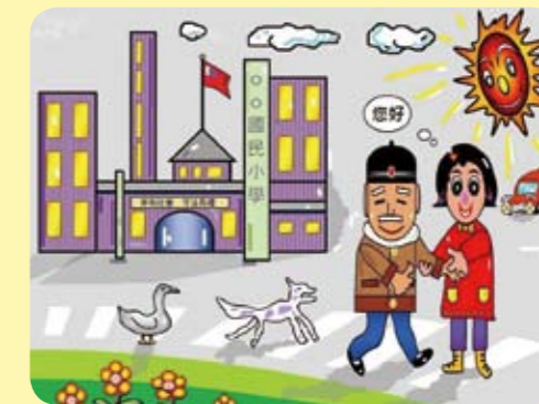
東湖國小三年級 陳紀妙 指導老師：張景翔