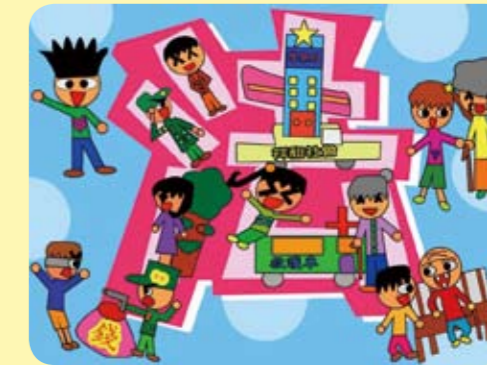
育才國小五年級 張楚彤 指導老師：彭依萍