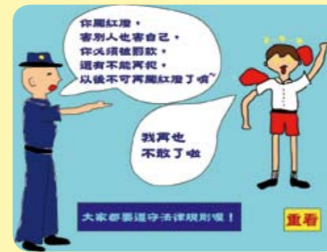
新民小學五年級 張晏寧 指導老師：李珮珮