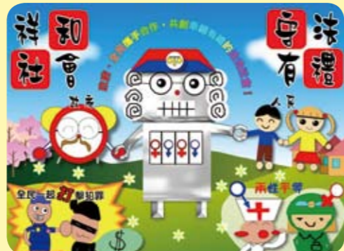
興德國小四年級 徐涵暄 指導老師：林美芳