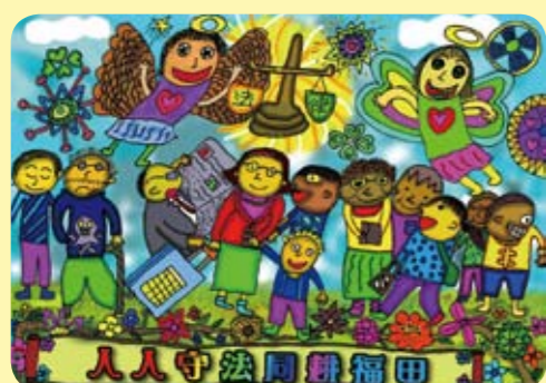
大龍國小四年級 黃喬琳 指導老師：范中翰