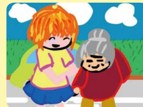
仁愛國中一年級 陳亭玉 指導老師：鄭連絲