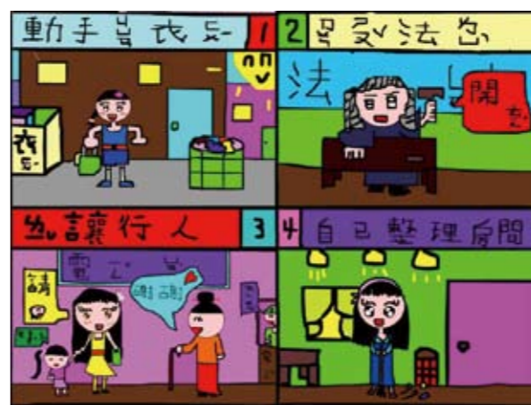
新民小學二年級 曾元柔 指導老師：李珮珮