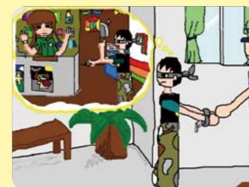
新民小學四年級 容愛鈞 指導老師：吳佩芬