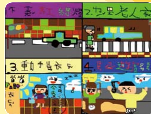
新民小學二年級 張以欣 指導老師：李珮珮