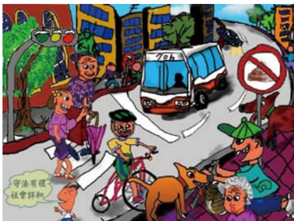
台北縣永平國小四年級 林義閔 指導老師：黃將豪