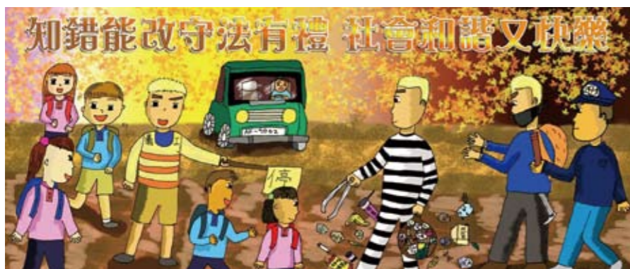
大龍國小五年級 徐孟瑜 指導老師：范中翰