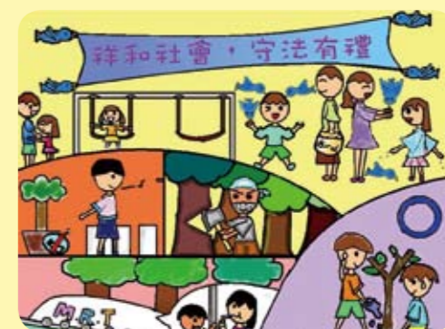
育才國小三年級 陳非比 指導老師：全容萱