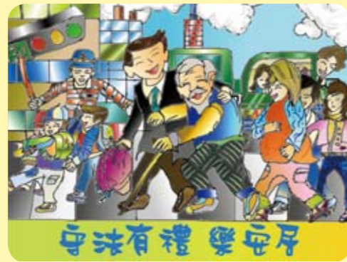
西松國小五年級 吳豪恩 指導老師：侯政宏