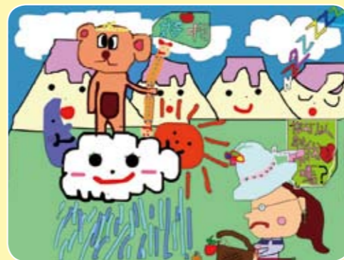
新民小學二年級 林佩希 指導老師：李珮珮