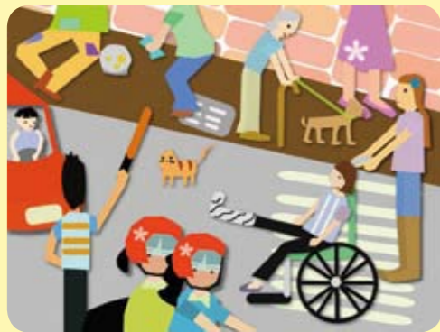
育才國小五年級 陳祈巨 指導老師：彭依萍