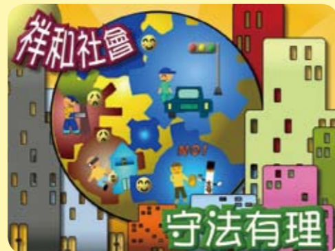
興德國小五年級 許瀚升 指導老師：林美芳