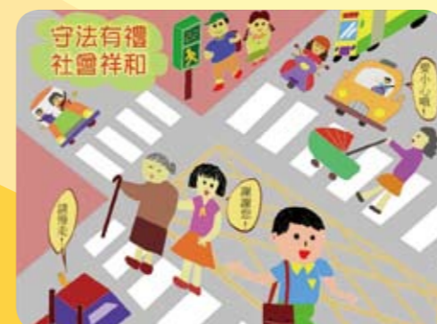
石牌國小三年級 陳 萱 指導老師：郭岱涵