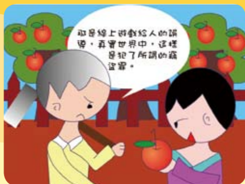
新民小學五年級 鄭姿琪 指導老師：許意苹