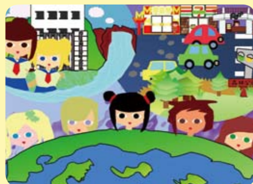
育才國小六年級 廖紹媛 指導老師：柯琬羚