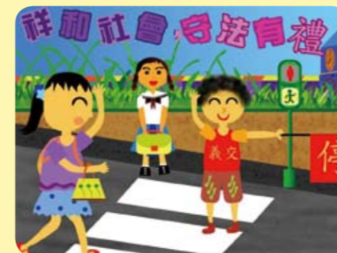
南港國小六年級 薛皓芸 指導老師：陳家亮