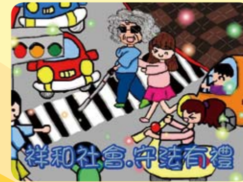
光仁小學六年級 楊幼瑄 指導老師：桑慧安