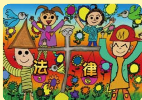
大龍國小三年級 詹杰穎 指導老師：范中翰