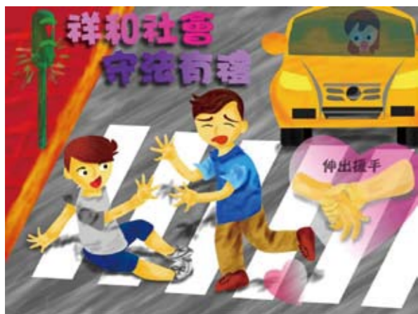
南港國小六年級 陳予歆 指導老師：陳家亮