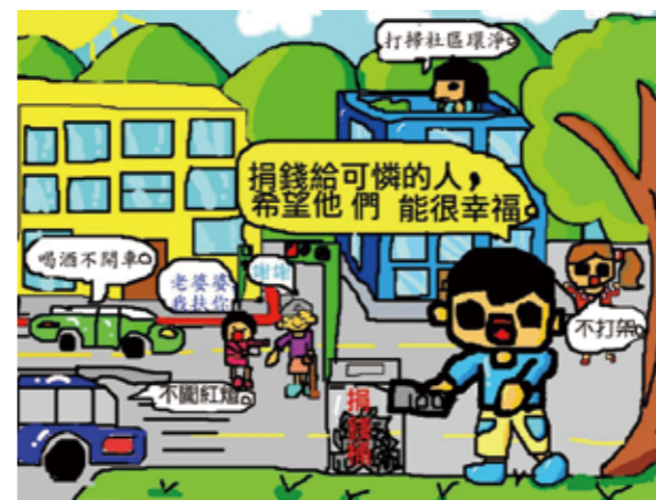
新民小學三年級 陳星凱 指導老師：李珮珮