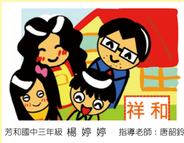
芳和國中三年級 楊婷婷 指導老師：唐韶鈴