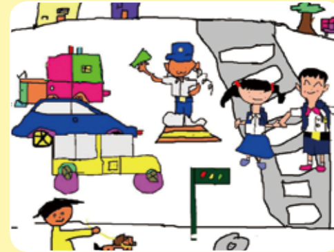
新民小學一年級 陳以均 指導老師：吳佩芬