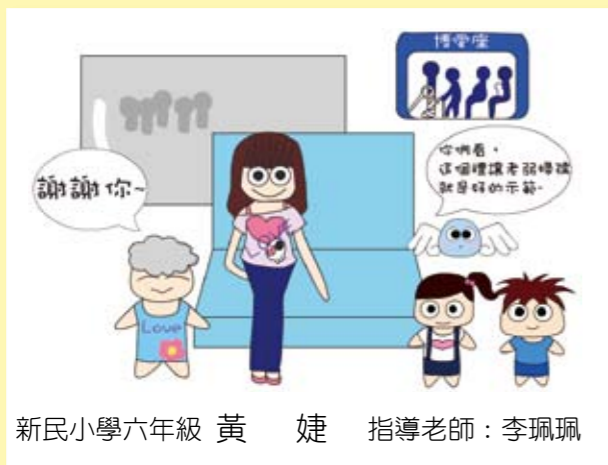
新民小學六年級 黃婕 指導老師：李珮珮