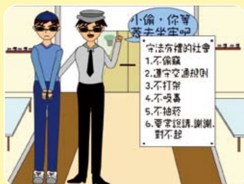
新民小學六年級 徐嫻孺 指導老師：李珮珮