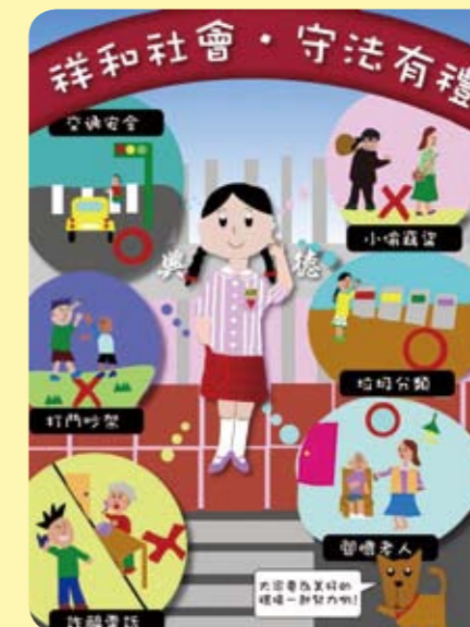
興德國小五年級 呂家瑋 指導老師：林美芳