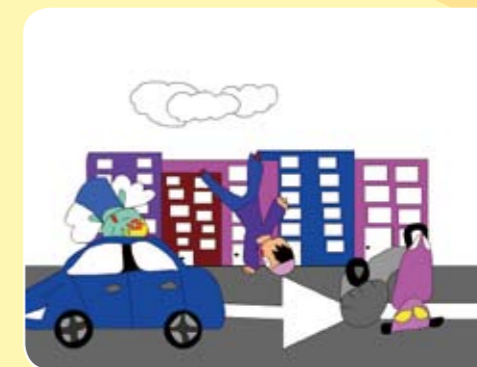
新民小學六年級 張琍晴 指導老師：吳佩芬