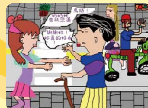
新民小學三年級 陳亮葵 指導老師：李珮珮