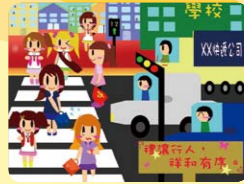
南港國小六年級 成孟葵 指導老師：陳家亮