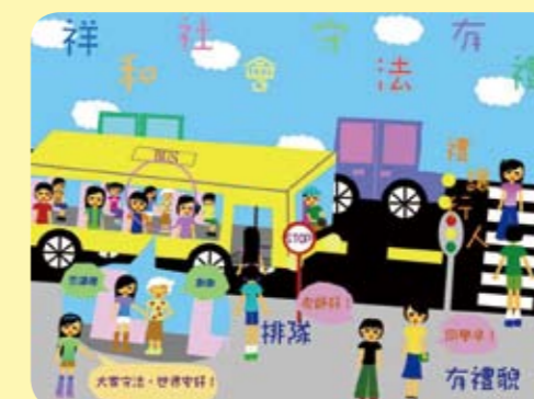
育才國小六年級 張鈺均 指導老師：柯琬羚