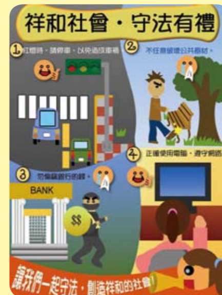
興德國小五年級 呂家綺 指導老師：林美芳