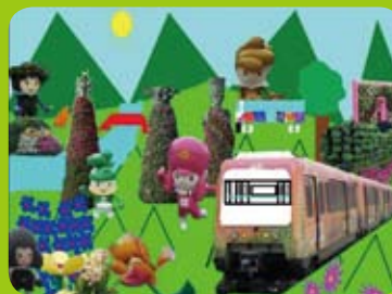
螢橋國中二年級 顧永釗 指導老師：顧澤民