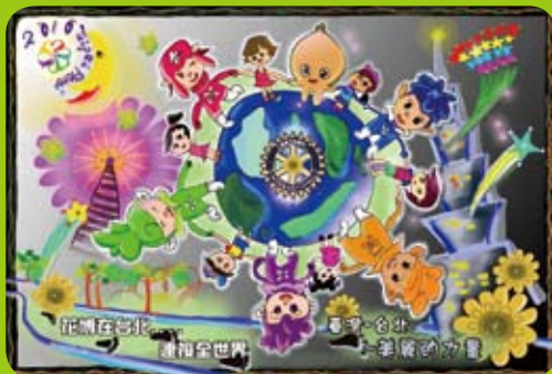
大橋國小四年級 顏嘉萱 指導老師：施銘璋