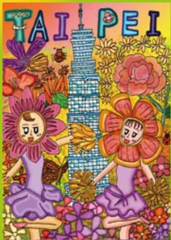
大龍國小四年級 徐子晴 指導老師：范中瀚