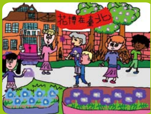
新民小學三年級 陳芊羲 指導老師：吳佩芬