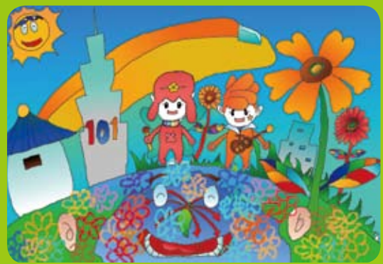
西松國小六年級 曾韋嘉 指導老師：李珮珮