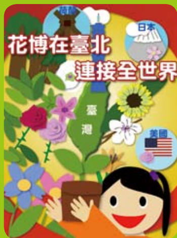
興德國小六年級 呂家綺 指導老師：李珮珮