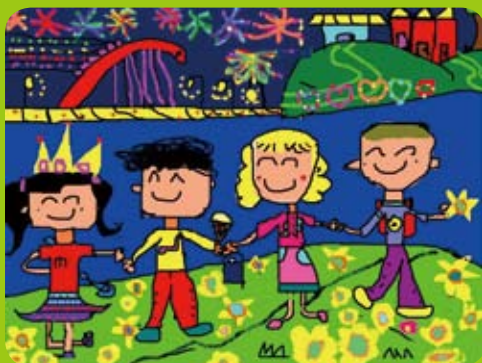
新民小學三年級 李昱潔 指導老師：吳佩芬