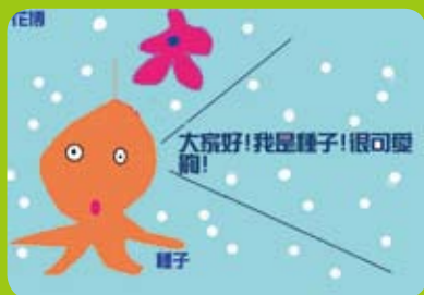
雙園國小五年級 簡宗緣 指導老師：石國棟