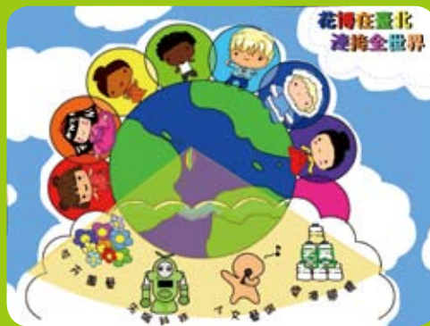
新民小學五年級 牟 芯 指導老師：吳佩芬