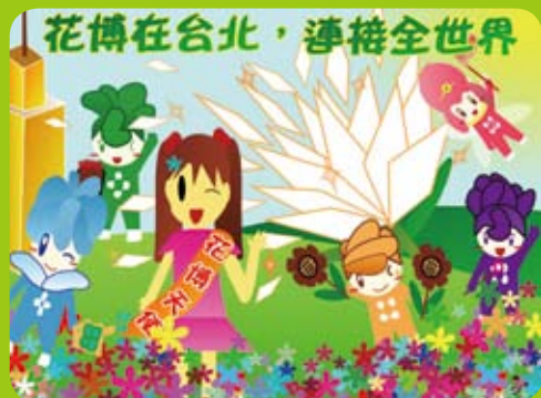
南港國小四年級 陳滢真 指導老師：陳家亮/林建明