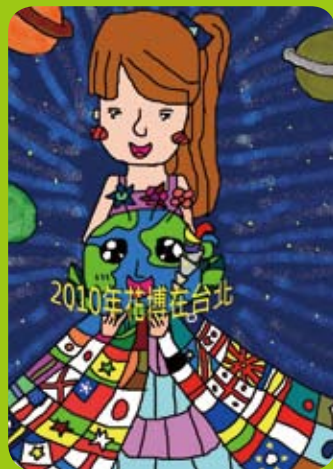
新民小學五年級 鄭樂琦 指導老師：范中瀚