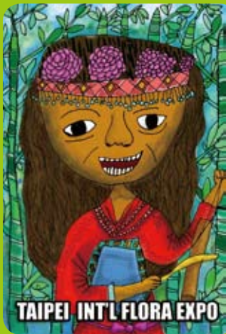
內湖國小三年級 郭羽柔 指導老師：范中瀚