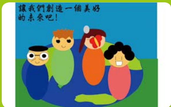
誠正國中二年級 陳嘉郁 指導老師：劉少熙