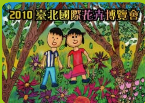
立農國小三年級 陳敬翰 指導老師：范中瀚