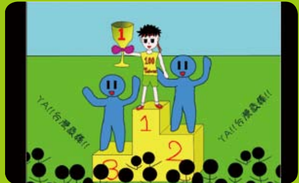
新民小學六年級 劉思妤 指導老師：李珮珮