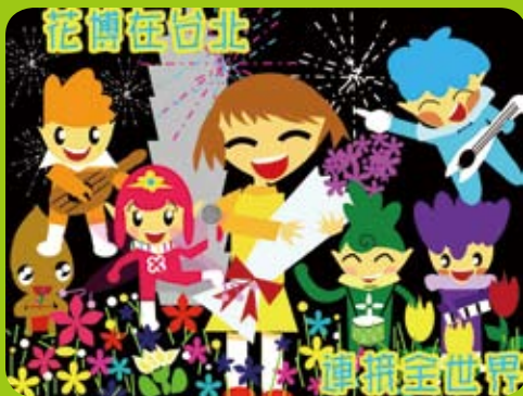
南港國小四年級 朱熾霖 指導老師：陳家亮/林建明