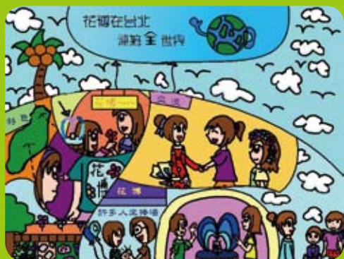
育才國小四年級 陳非比 指導老師：楊詠婷