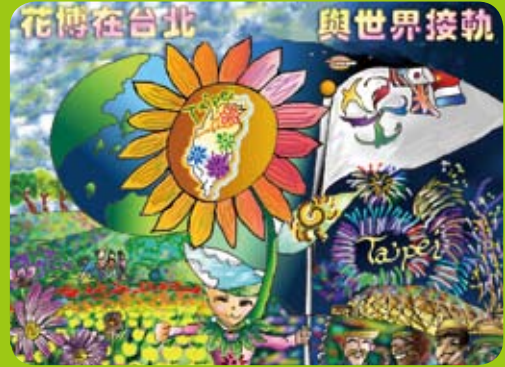
西松國小六年級 吳豪恩 指導老師：范中瀚