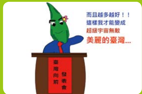
新民小學六年級 曾允燁 指導老師：吳佩芬