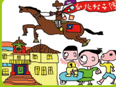
新民小學二年級 陳以均 指導老師：吳佩芬