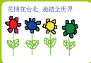
長安國中二年級 郭子睿 指導老師：于守然