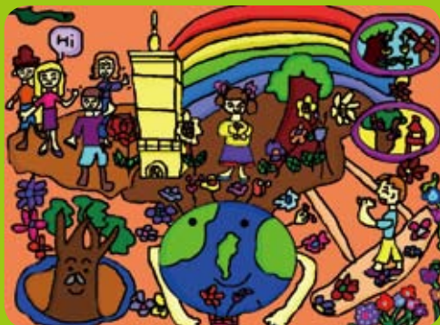
育才小學四年級 姜 蕎 指導老師：楊詠婷