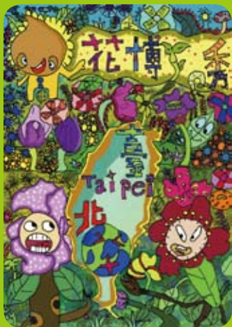
明倫國小五年級 何品儀 指導老師：李珮珮