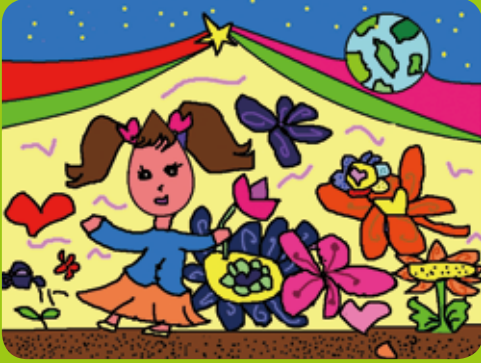
育才國小二年級 黃珮嫻 指導老師：彭依萍