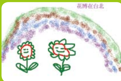
長安國中二年級 楊博勛 指導老師：于守然