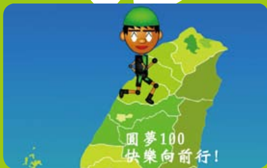
光仁小學六年級 丘智偉 指導老師：桑慧安