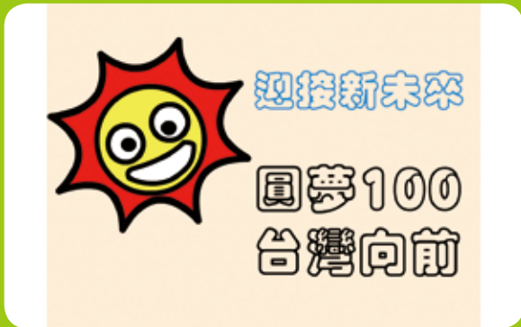
誠正國中二年級 丘于芹 指導老師：劉少熙