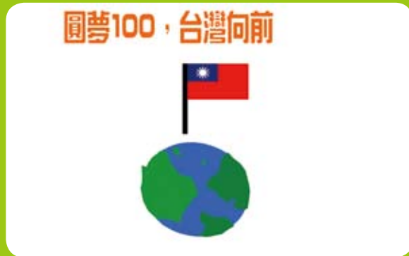
誠正國中二年級 洪千琇 指導老師：劉少熙