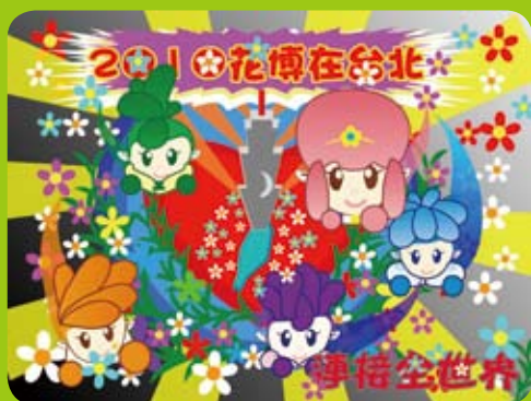
南港國小六年級 沈頌哲 指導老師：林美芳