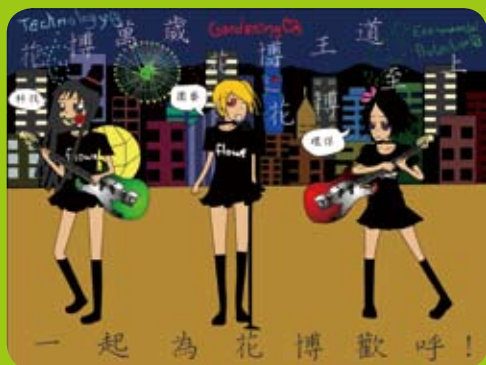
新民小學六年級 陳湘淇 指導老師：陳思琪