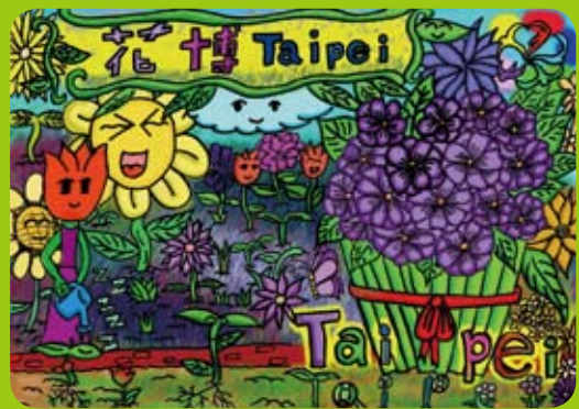
明倫國小五年級 林小珍 指導老師：李珮珮