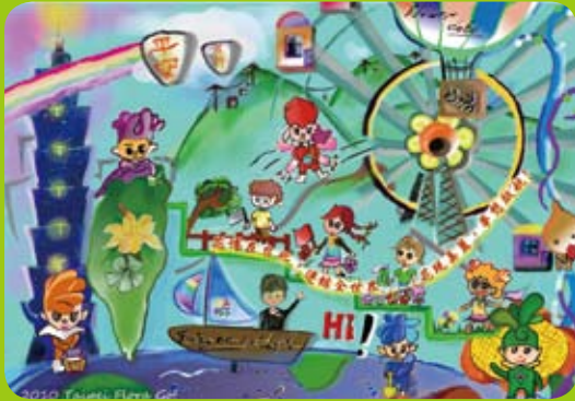
大橋國小六年級 洪嘉駿 指導老師：陳家亮/林建明