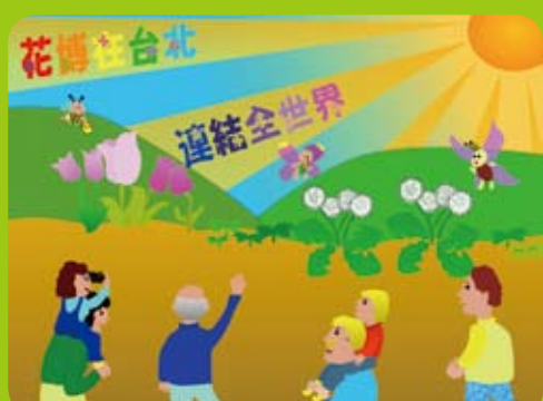
景興國小四年級 戴楷原 指導老師：吳欽鴻