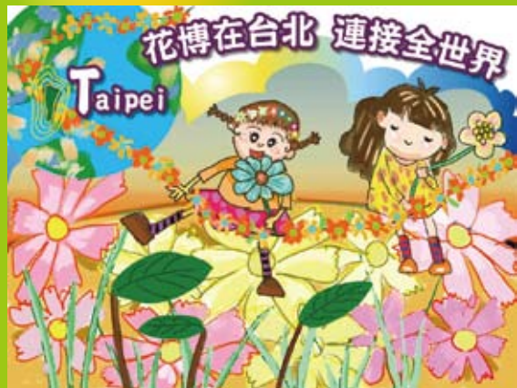
長安國小三年級 黃婕瑜 指導老師：朱韻婷/李雙鳳