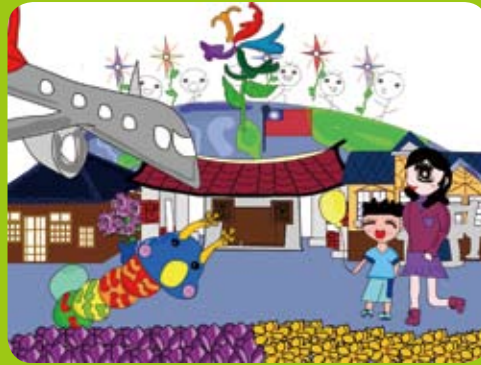
新民小學五年級 簡君穎 指導老師：陳思琪