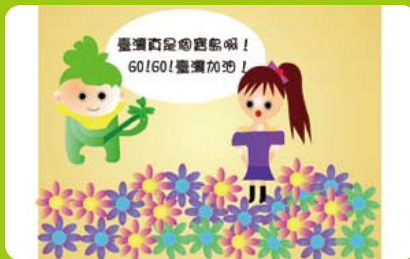
東湖國小六年級 鄭姿琪 指導老師：許意苹