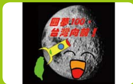
興雅國中一年級 呂奇典 指導老師：黃宜文