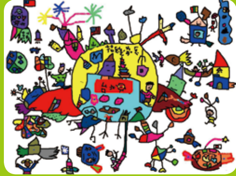
新民小學二年級 張 禾 指導老師：吳佩芬