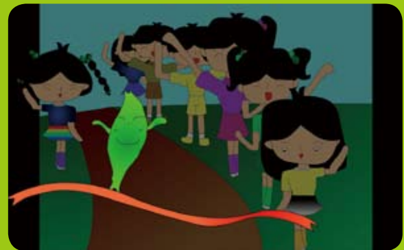
新民小學六年級 蔣侑伶 指導老師：李珮珮