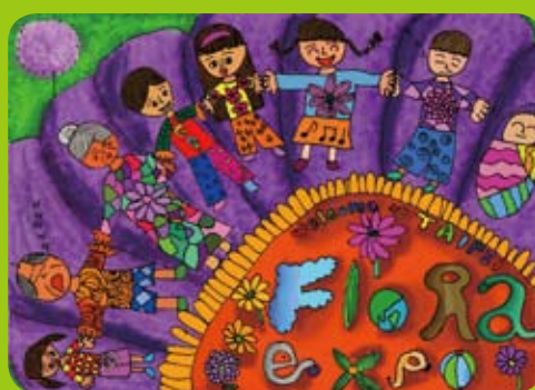
內湖國小四年級 郭思雅 指導老師：范中瀚