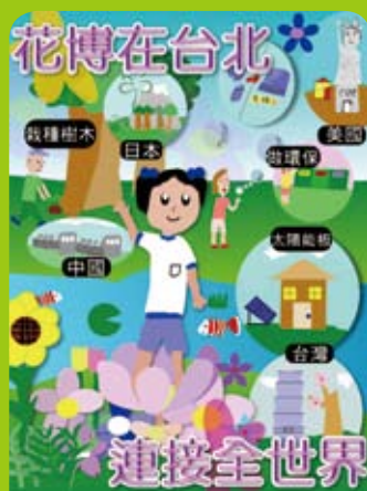
興德國小六年級 呂家瑋 指導老師：吳佩芬