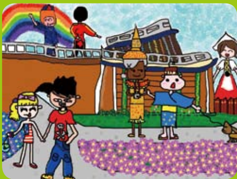
新民小學五年級 李麗淇 指導老師：林美芳