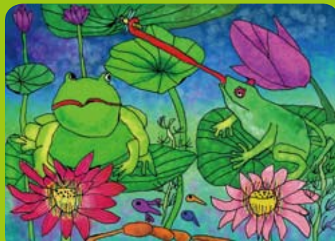
內湖國小三年級 郭宜柔 指導老師：范中瀚