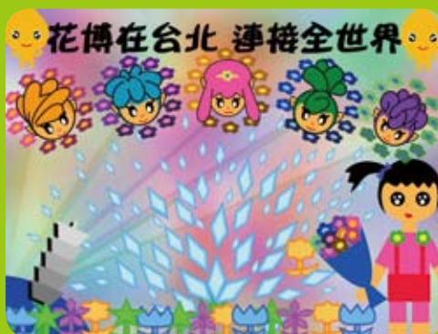
南港國小六年級 林姿岑 指導老師：施銘璋