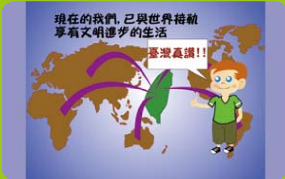
東湖國小六年級 林耿仲 指導老師：許意苹