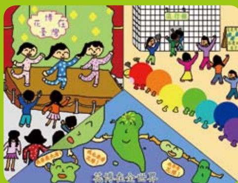
新民小學四年級 黃睦淳 指導老師：李珮珮