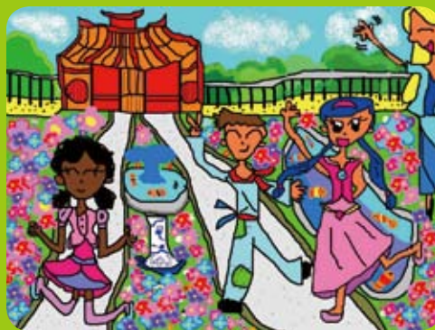
新民小學三年級 詹蕙心 指導老師：吳佩芬