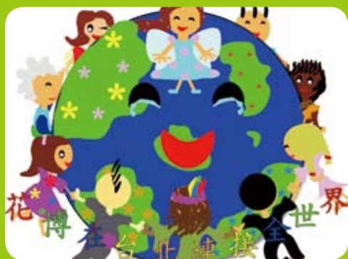
新民小學四年級 何孟濤 指導老師：李珮珮