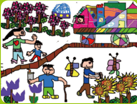
新民小學一年級 劉思婕 指導老師：吳佩芬