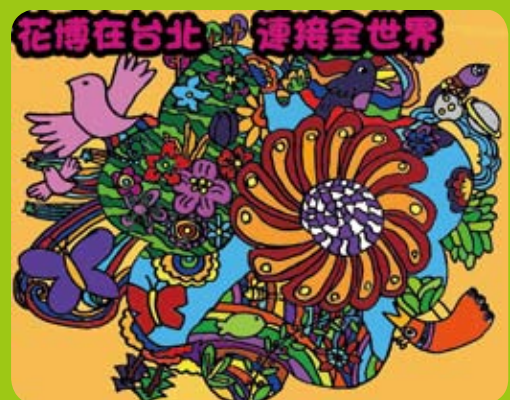
金龍國小六年級 張君維 指導老師：范中瀚